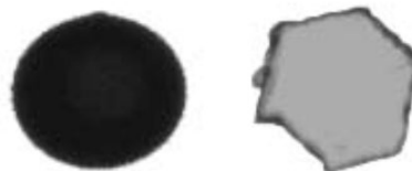
Figure 1: Although both yield similar results in equivalent spherical diameter, the sphere on the left is actually quite different from the flat disc on the right. A system that orients the largest area of the particle at the viewing point would be unable to see all dimensions of the particle.

Figure 1 shows a polystyrene latex bead, which is spherical, and a particle that is a flat disc. To a static image analysis system or microscope that orients the largest area of the particle toward the viewing point, these particles are reported as the same and render similar equivalent spherical size data. However, by the very nature of their shape, these particles would flow differently in a manufacturing process and have a different impact on the final product.